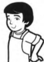
put on an apron