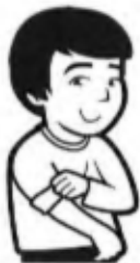
roll up your sleeves