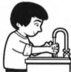
wash your hands