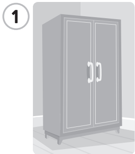
_____ cupboard _____